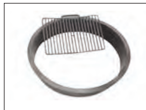
Upgrade your Semco Fire Pit with #2581 BBQ Grill Insert